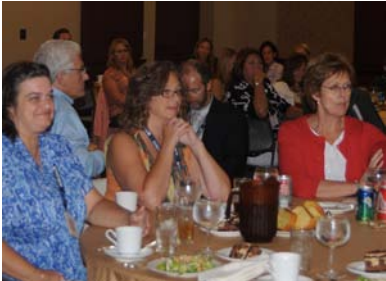
State counseling board representatives listen to a presentation