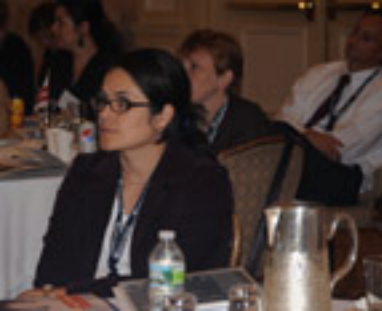
State counseling board representatives

Over the years and on behalf of our certificants, NBCC has developed close working relationships with other counselor organizations and state licensure boards. These strong working relationships support the continued growth and recognition of professional counselors. One example of NBCC's commitment to this relationship building is the meeting of state licensure boards. This past August, NBCC hosted a state licensure board meeting in Washington, DC—a location specially chosen to commemorate the milestone of counselor licensure in all 50 states. While the primary focus was state licensure examinations and emerging issues in the counseling profession, the meeting also provided multiple opportunities for representatives to network and share ideas.